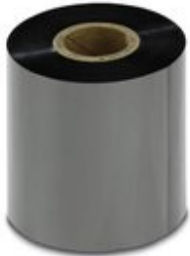
Ink ribbon, for roll printer for printing product group WMS..., width: 64 mm, color: black

Please be informed that the data shown in this PDF Document is generated from our Online Catalog. Please find the complete data in the user's documentation. Our General Terms of Use for Downloads are valid ( http://phoenixcontact.com/download )